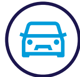
ALLOCATED CAR PARKING