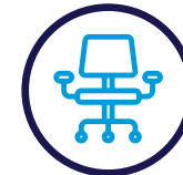
FIRST FLOOR OFFICES