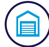
ELECTRIC ROLLER SHUTTERS