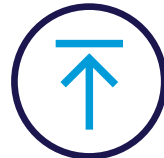
MIN. 6M EAVES HEIGHT