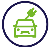
EV CHARGING POINTS