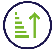
EPC RATING A-1-2