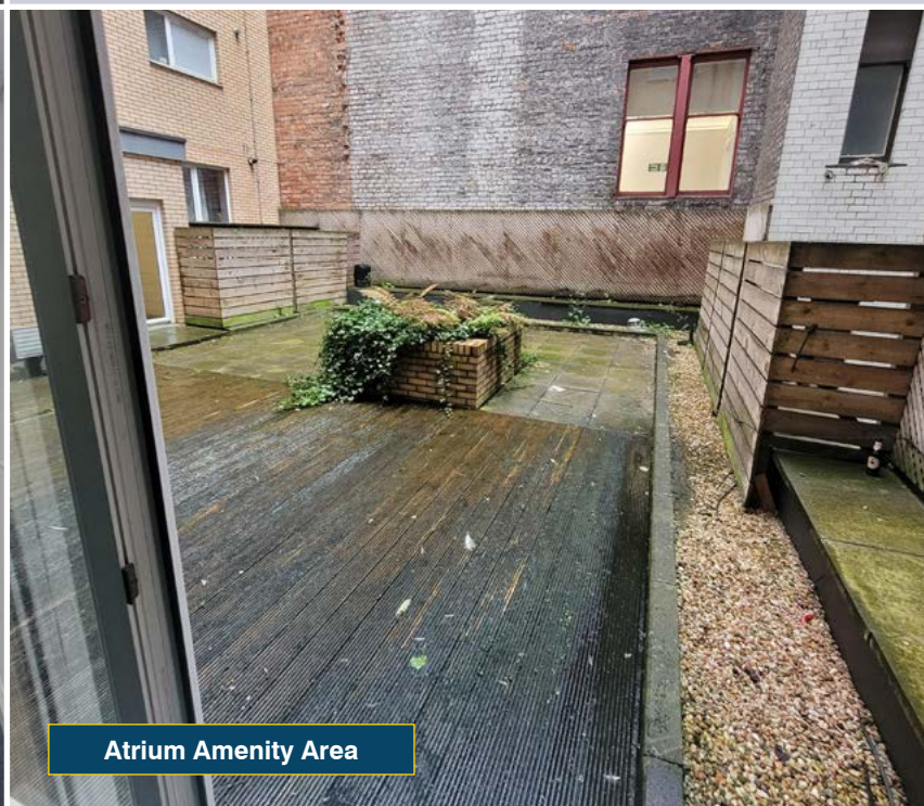
Atrium Amenity Area