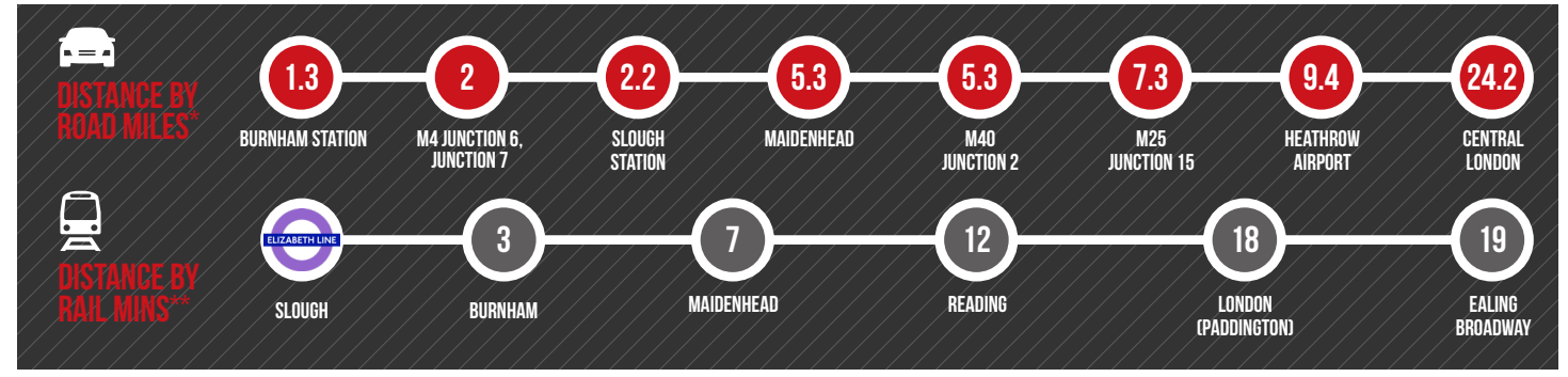
SOURCE: * FROM 97 WHITBY ROAD SL1 3DR. SOURCE: THE AA ** TIMES FROM SLOUGH STATION. SOURCE: NATIONAL RAIL ENQUIRIES