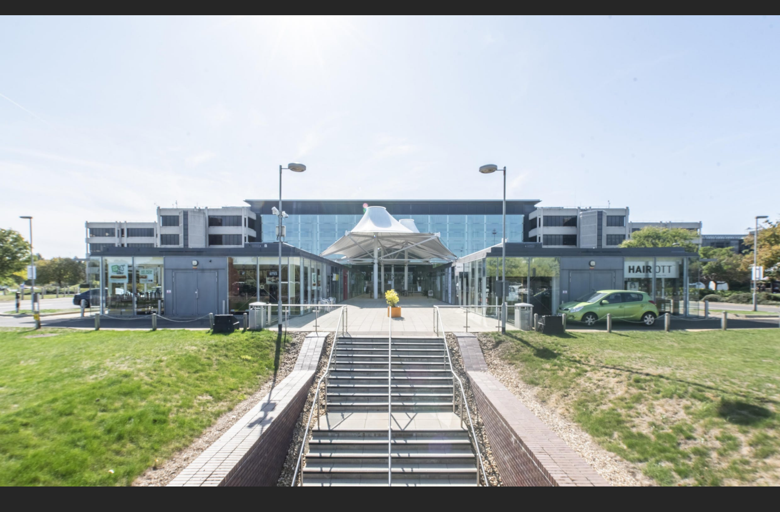
Regus - Lakeside

Building 1000, Lakeside North Harbour, Portsmouth, PO6 3EZ