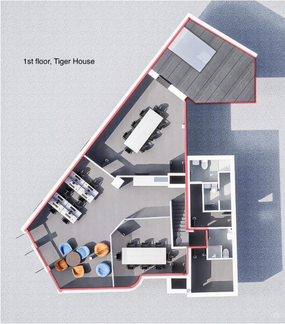
1<sup>st</sup> floor | 1,200 sq. ft.