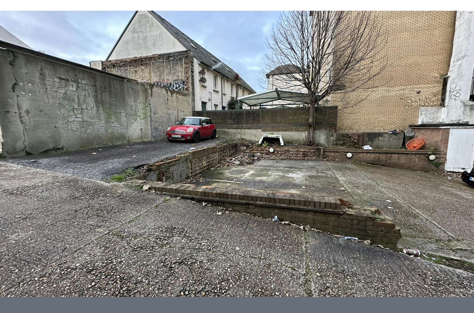
3 - 4 Parking Spaces