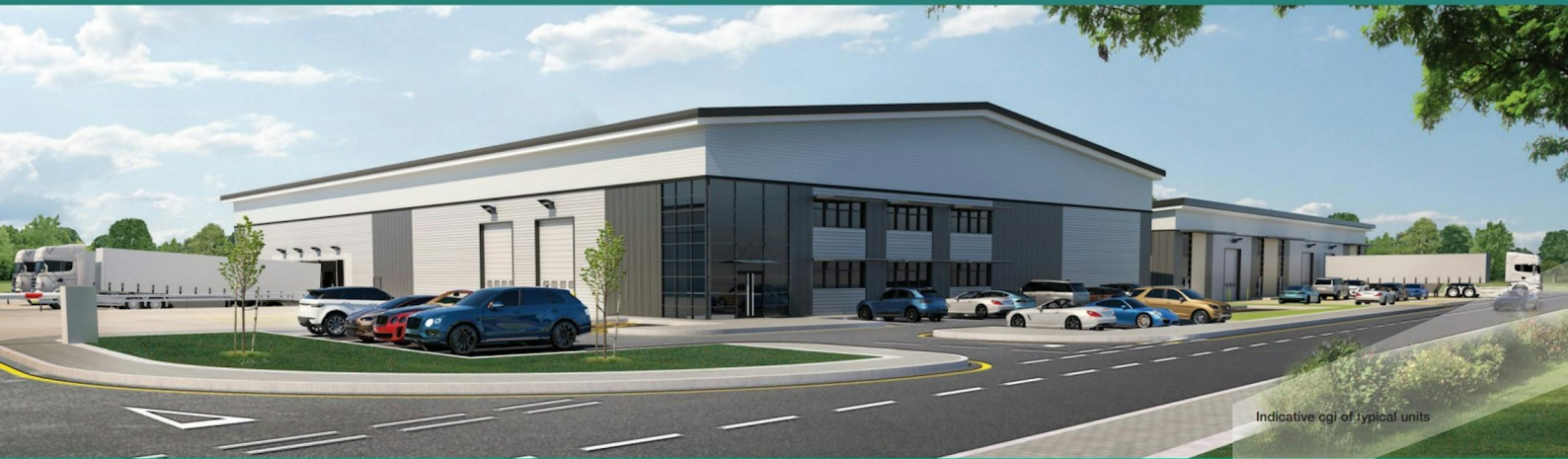
Indicative egi of typical units

PHASE 2 - NEW BUILD UNITS FROM 4,532 - 40,000 SQ FT