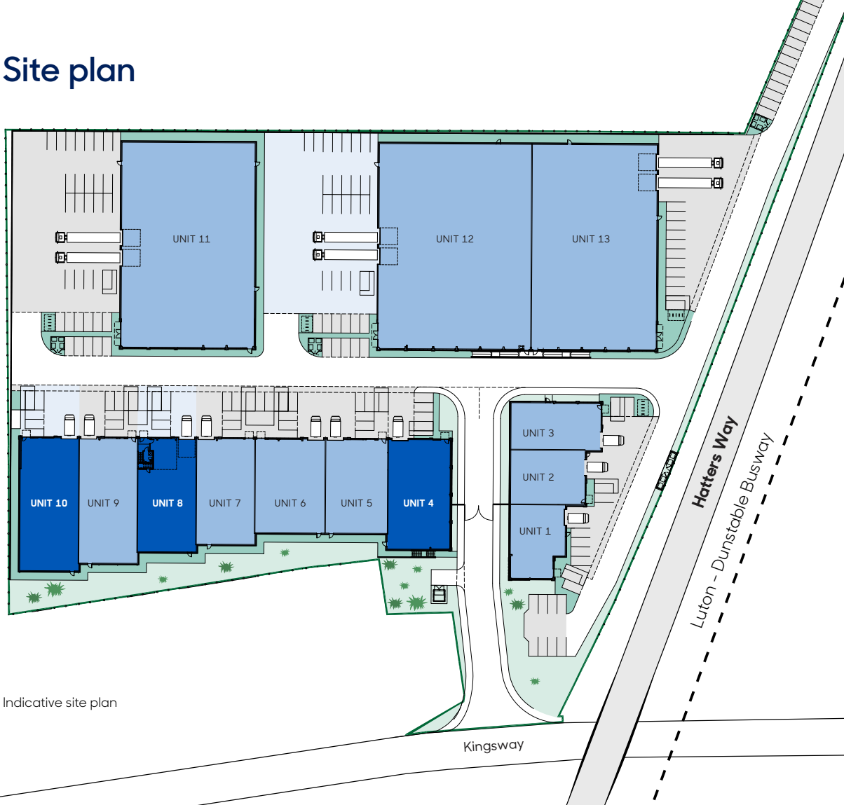
Indicative site plan