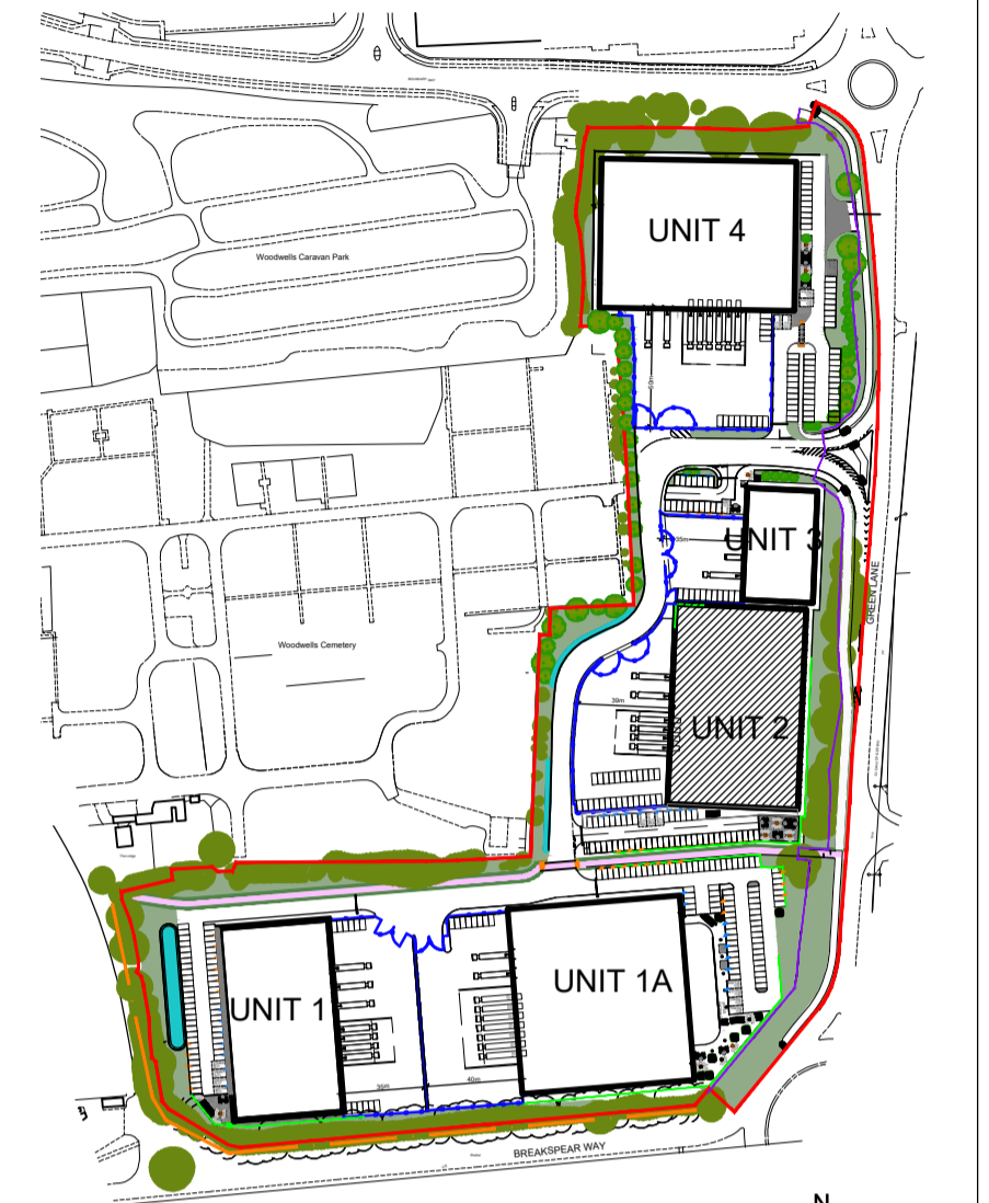
02 KEY PLAN 212 NTS