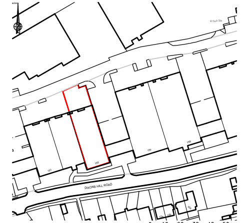
Location Plan - 1:2500 K.A.D. Licensed O.S. No. 100047482