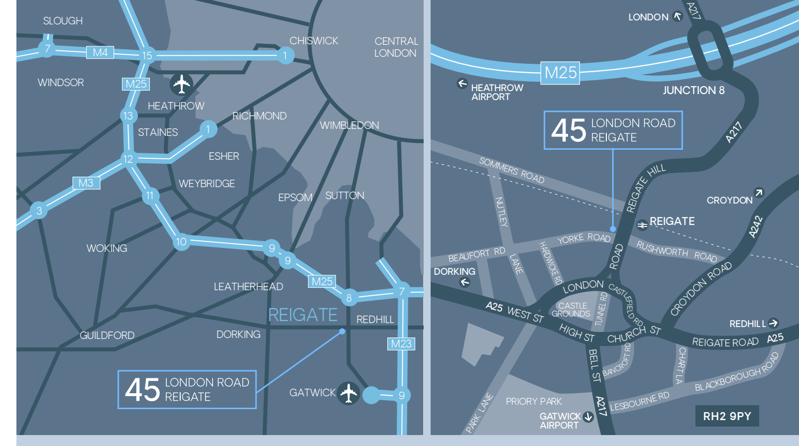
Indicative maps only. Not to Scale