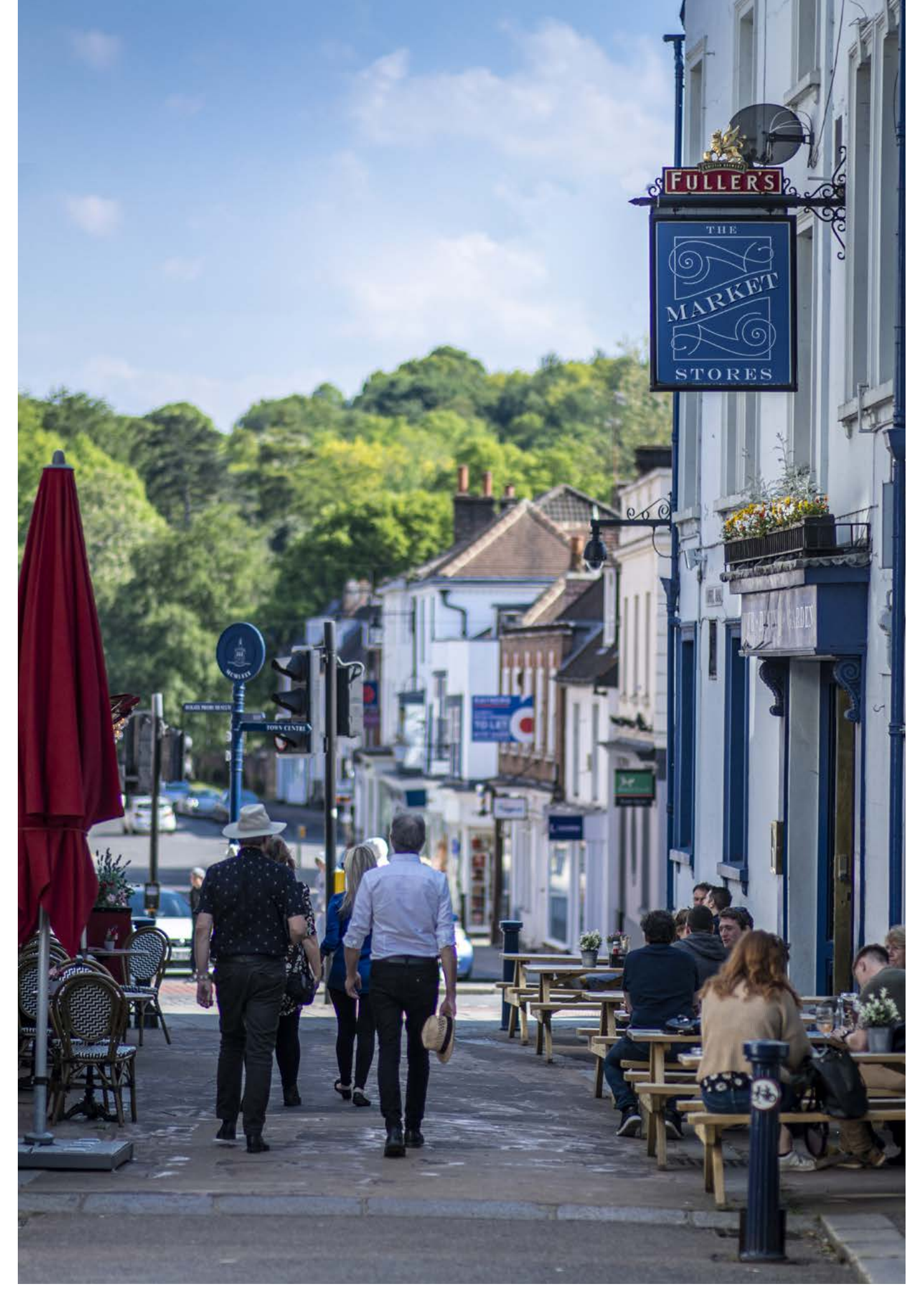
Outdoor dining on Tunnel Road

The town is also well known for its excellent variety of restaurants, cafes, delicatessens and pubs. High street brands and gourmet independent operators including Bills, Wagmama, Café Rouge, Giggling Squid, Gails, Pizza Express, Nandos, and Chalk Hills Bakery offer a vast array of cuisines.