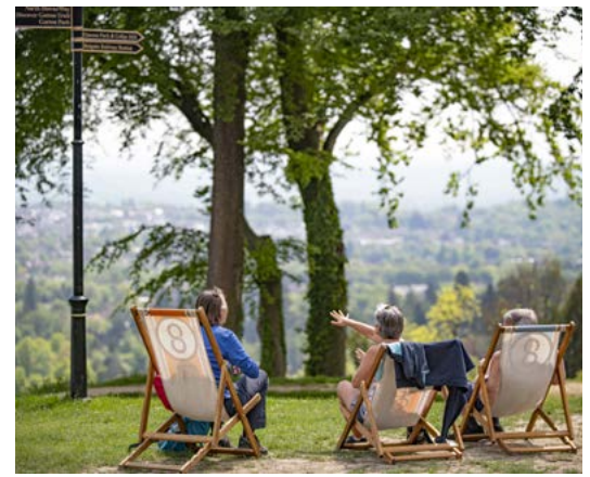
View from the 4th Floor