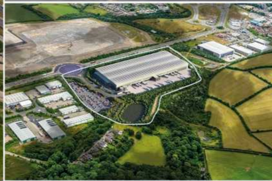
Barnsley 340 340,000 sq ft Grade-A logistics unit