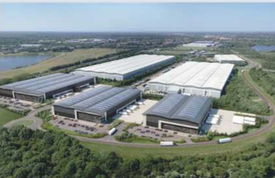
Peterborough South Peterborough Three warehouse / logistics units 94,225 to 240,830 sq ft

As we invest, develop and deliver, we remain true to our core values of being progressive in our thinking, decisive in our actions and committed to high standards.