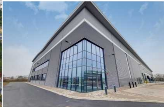
Ascent Logistics Park Leighton Buzzard Eight warehouse / industrial units 14,140 to 123,490 sq ft