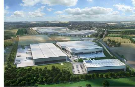
Sherburn 42 Sherburn-in-Elmet, Leeds 4 prime industrial / distribution units from 57,750 – 280,000 sq ft