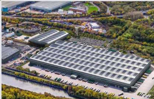
Link Logistics Park Ellesmere Port Two new warehouse / logistics units of 654,225 sq ft and 107,506 sq ft