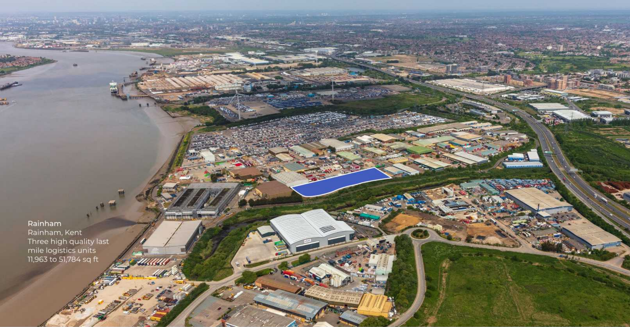
Rainham Rainham, Kent Three high quality last mile logistics units 11,963 to 51,784 sq ft