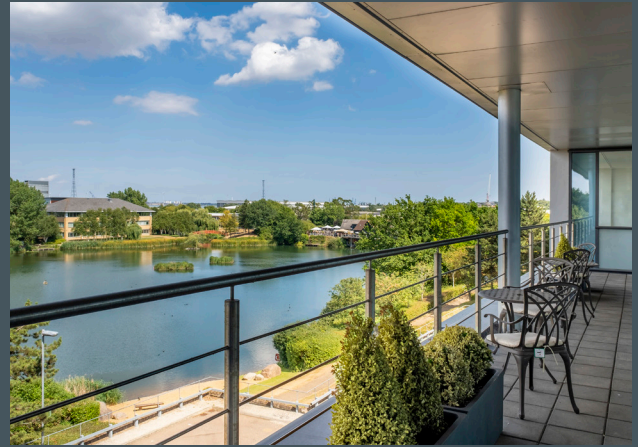
Second floor terrace

A thriving business park environment with excellent on-site and local amenities.