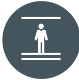
FULL ACCESS RAISED FLOORS