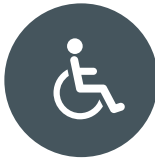
FULLY DDA COMPLIANT