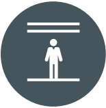
METAL SUSPENDED CEILINGS