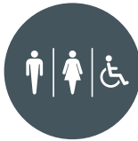
MALE, FEMALE & DISABLED WC'S