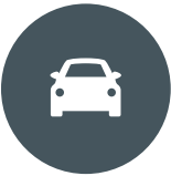
EXCELLENT PARKING RATIO OF 1:241 SQ FT