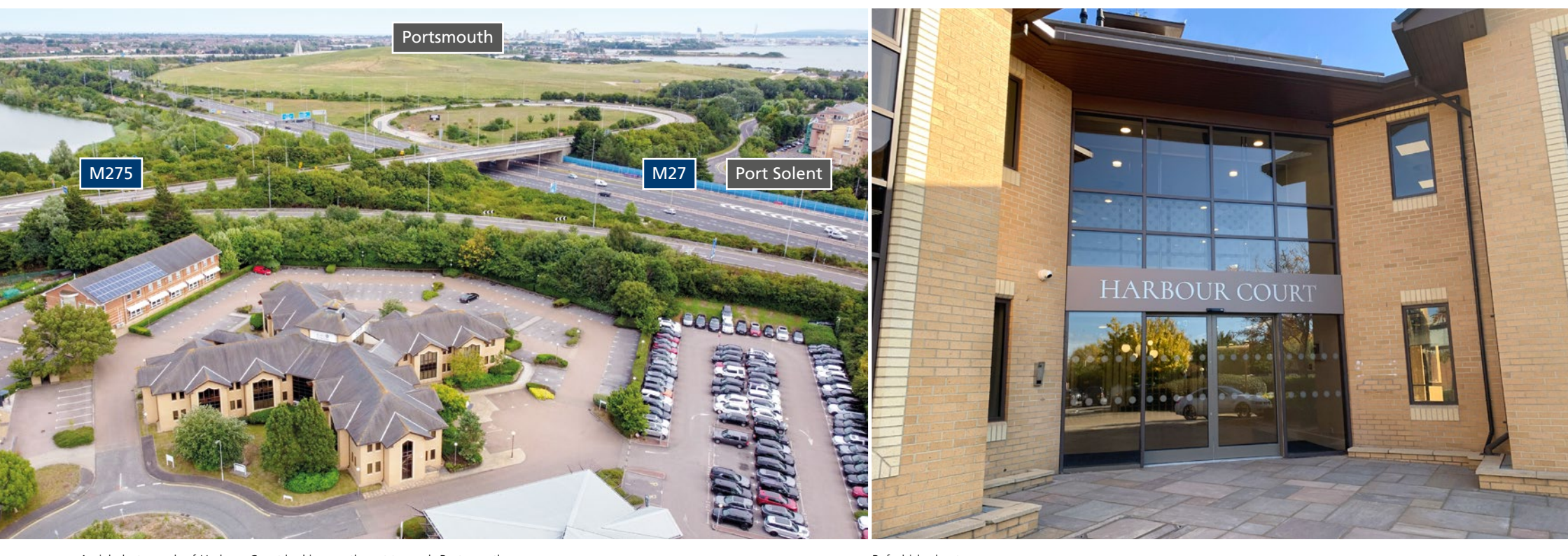
Aerial photograph of Harbour Court looking south east towards Portsmouth.