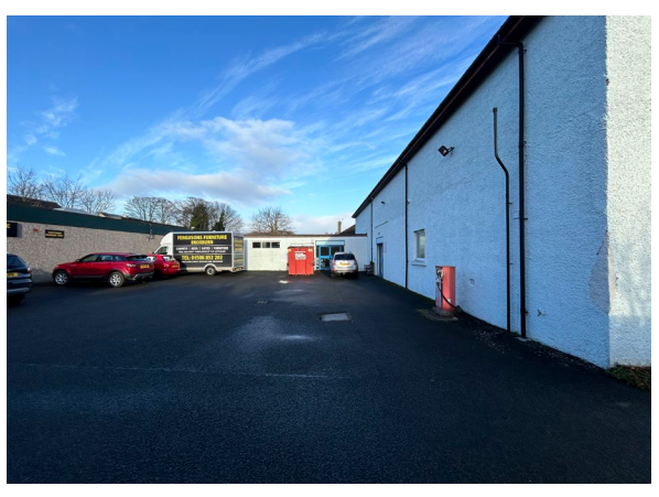
12 West Main Street, Broxburn, West Lothian, EH52 5RH