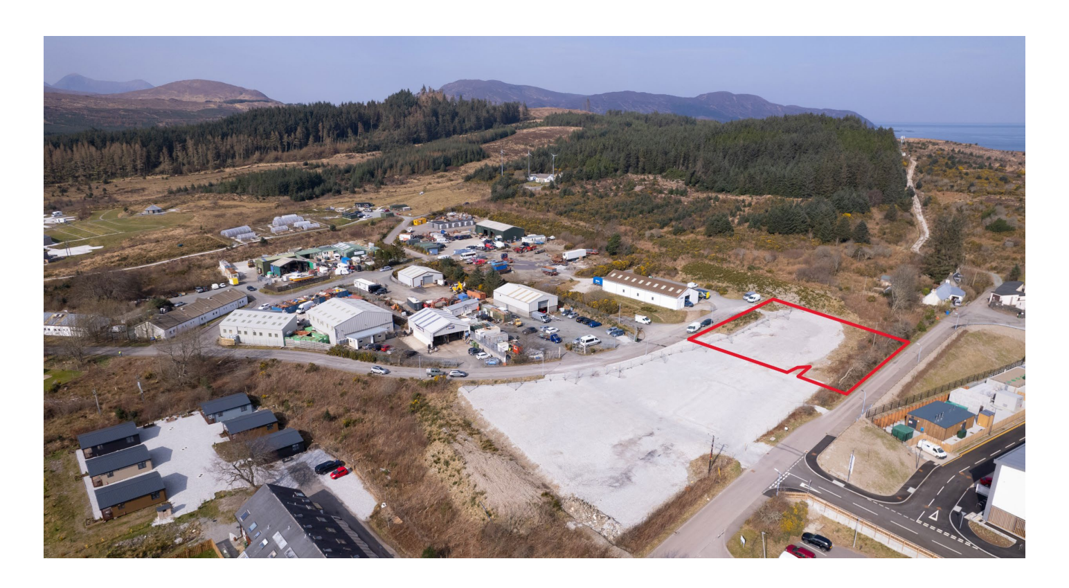
Site 14, Broadford Industrial Estate, Broadford, Isle of Skye IV49 9AP