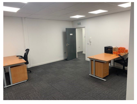
Unit 4 Lindsay Court, Technology Park, Dundee, DD2 1SW