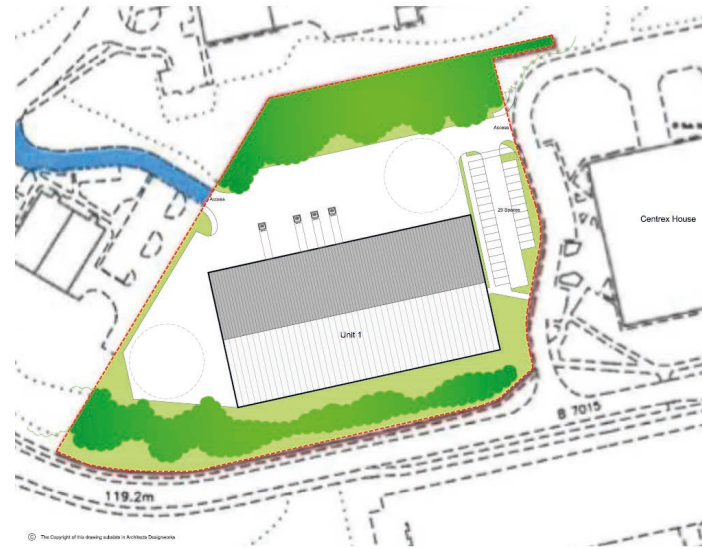
Indicative Site Layout