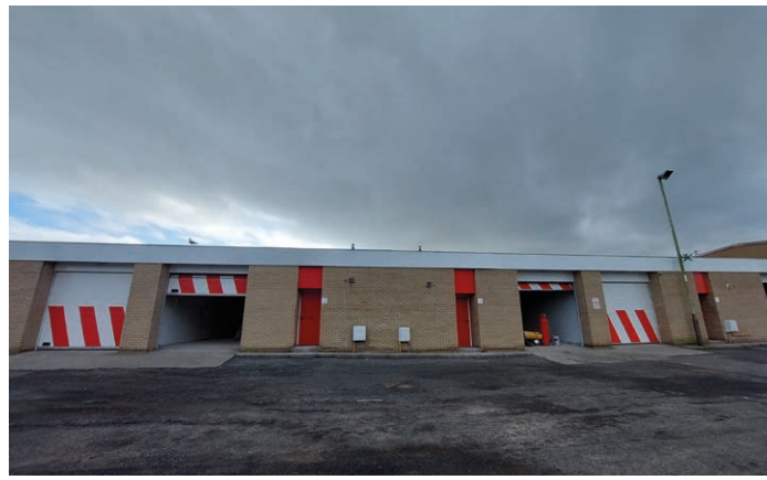
ARRAN PLACE, NORTH MUIRTON INDUSTRIAL ESTATE, PERTH, PH1 3DU