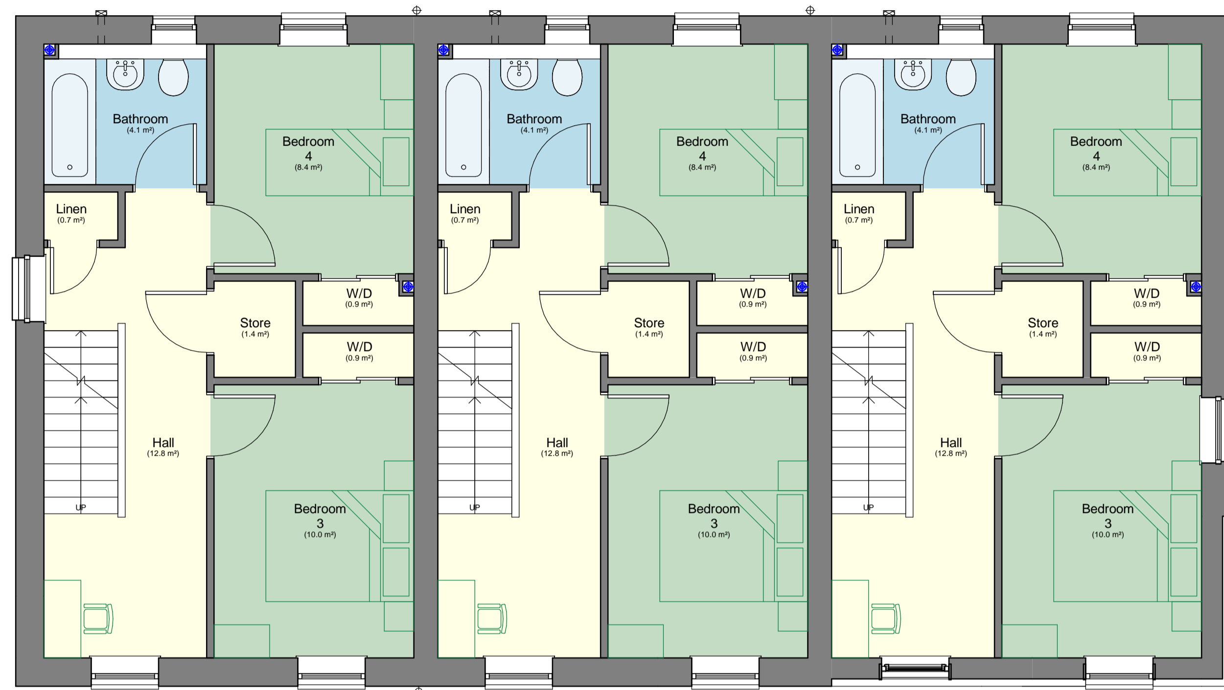
2 First Floor Plan 1:50