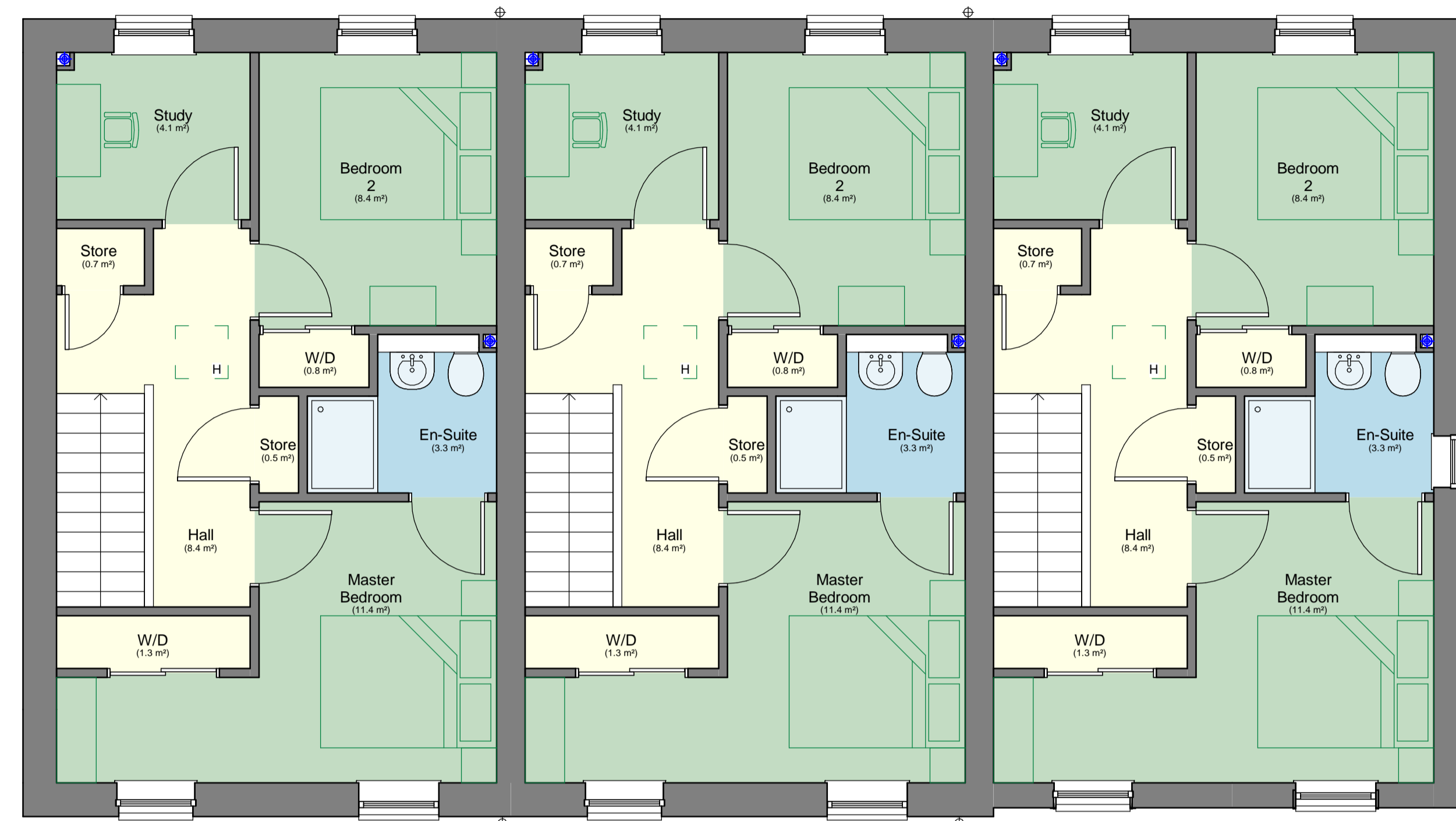
3 Second Floor Plan 1:50