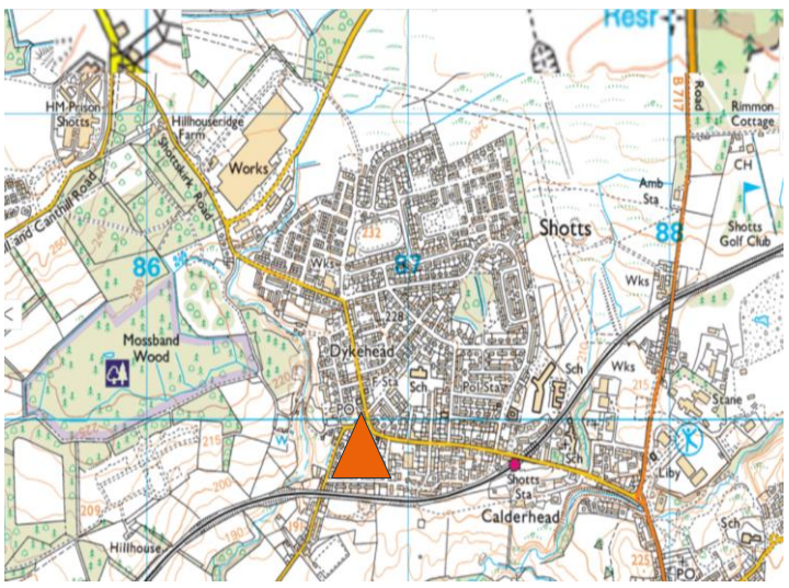
The location map above is for illustrative purposes only.