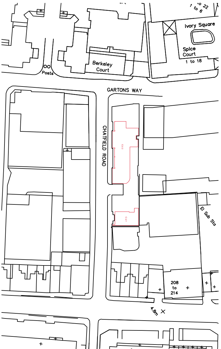
SITE PLAN @SCALE 1:1250