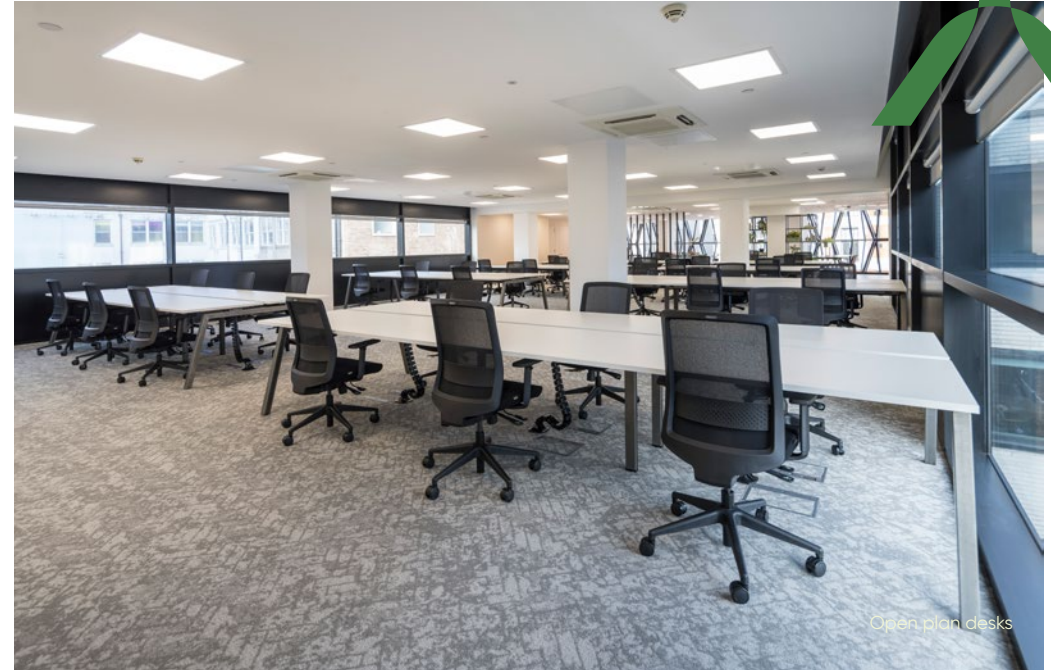
Open plan desks

For indicative purposes only. Not to scale.