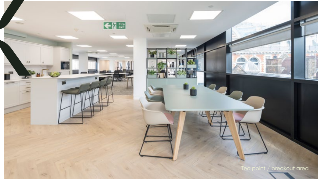
Tea point / breakout area