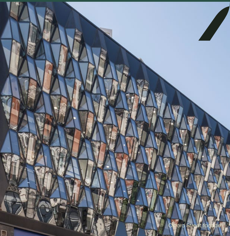
Oxford Street façade