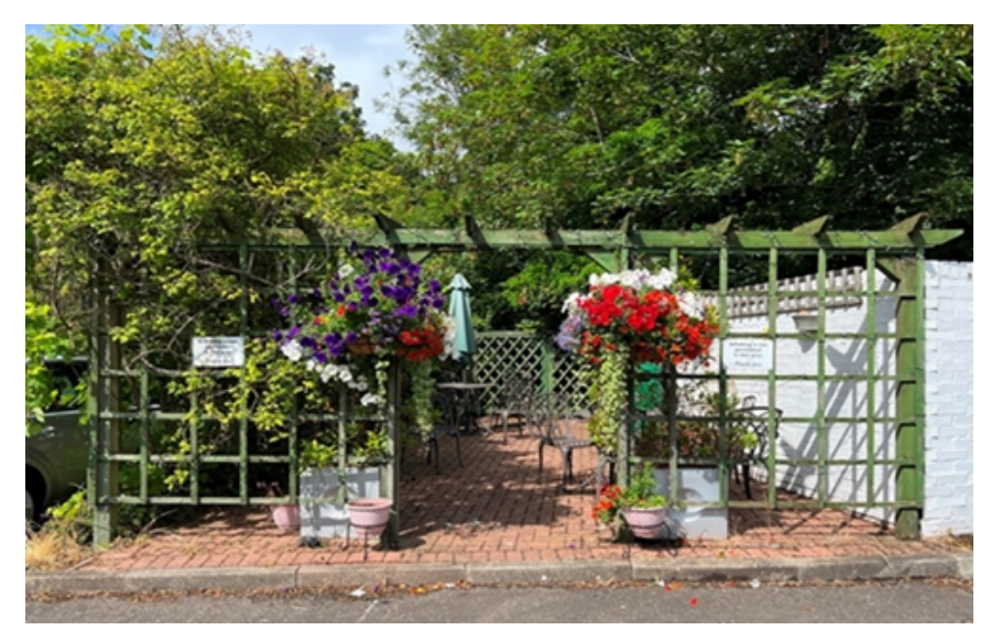
Communal External Break-Out Area