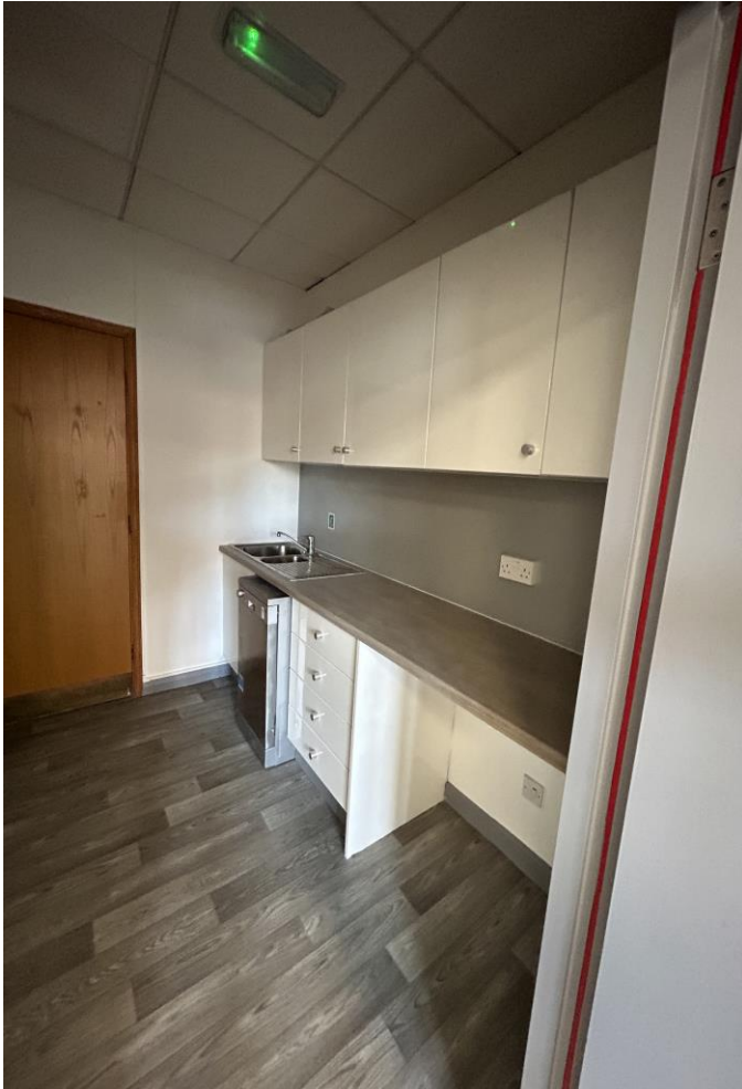
1 st FLOOR SUITE - KITCHEN