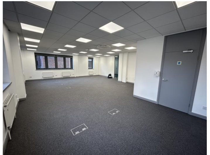
1 st FLOOR SUITE – RECENTLY REFURBISHED