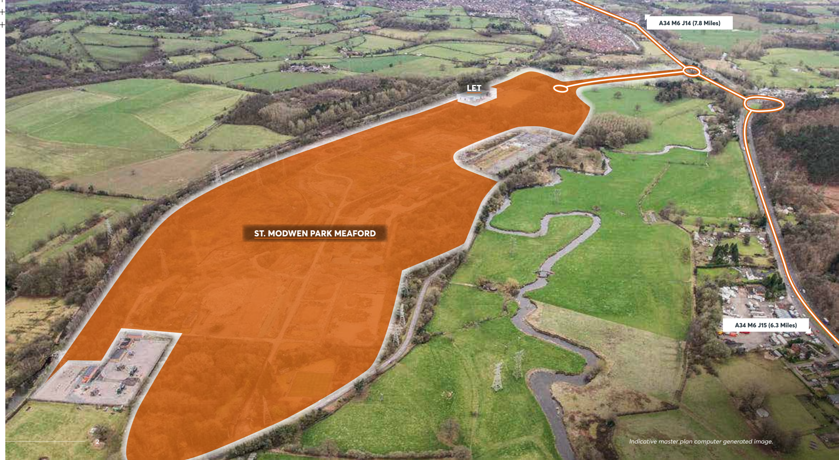
Indicative master plan computer generated image.