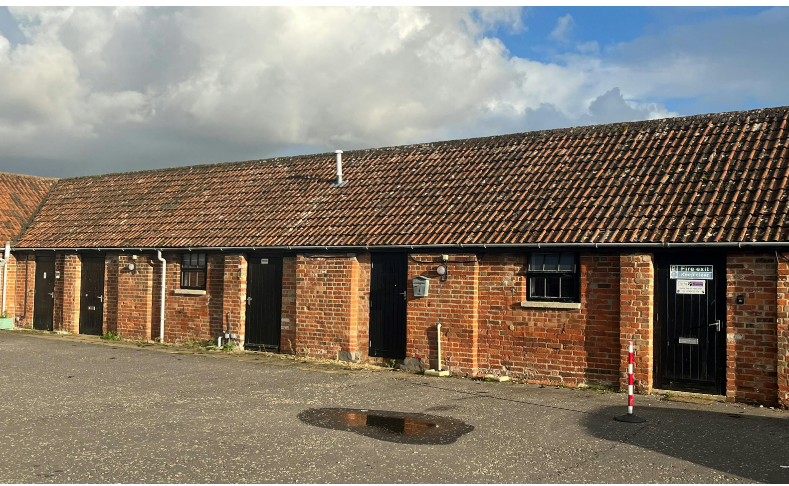
Units 6, 7 & 8 Lotmead Business Village, Wanborough,