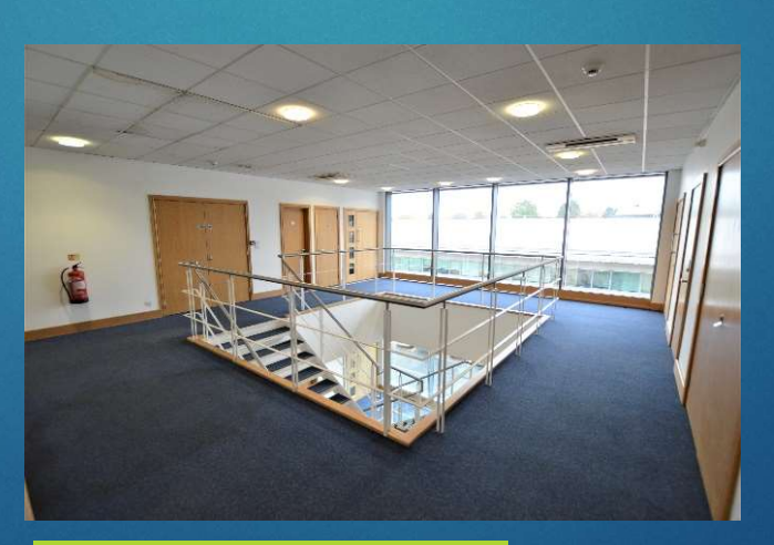
Second floor lobby