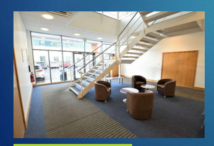
Ground floor entrance lobby