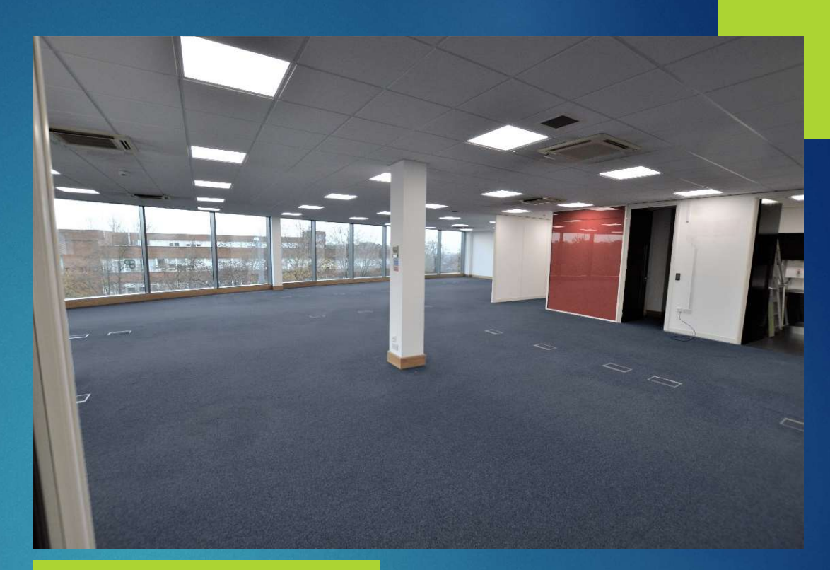
Open plan area from rear corner

Spacious exceptional specification offices High speed passenger lift DDA compliant Newly refurbished to high standard Full height hardwood feature doors throughout 75mm raised access floors New carpets and redecorated Air source heating and cooling heating LED lighting Excellent natural lighting, solar controlled glazing Newly rebuilt toilets, and showers Barrier controlled underground car parking Un-paralleled views across the Crimple Valley