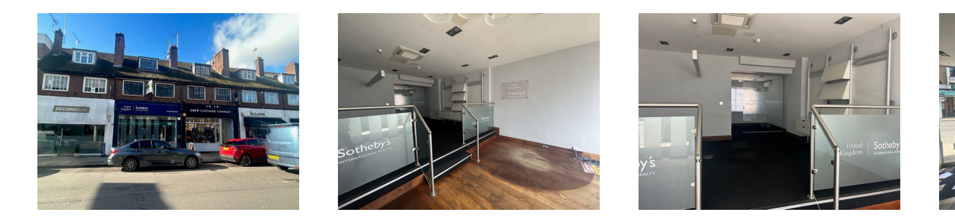
Rent: £52,500 Per annum + VAT Size: 557 Square feet Ref: #3143 Status: New on!