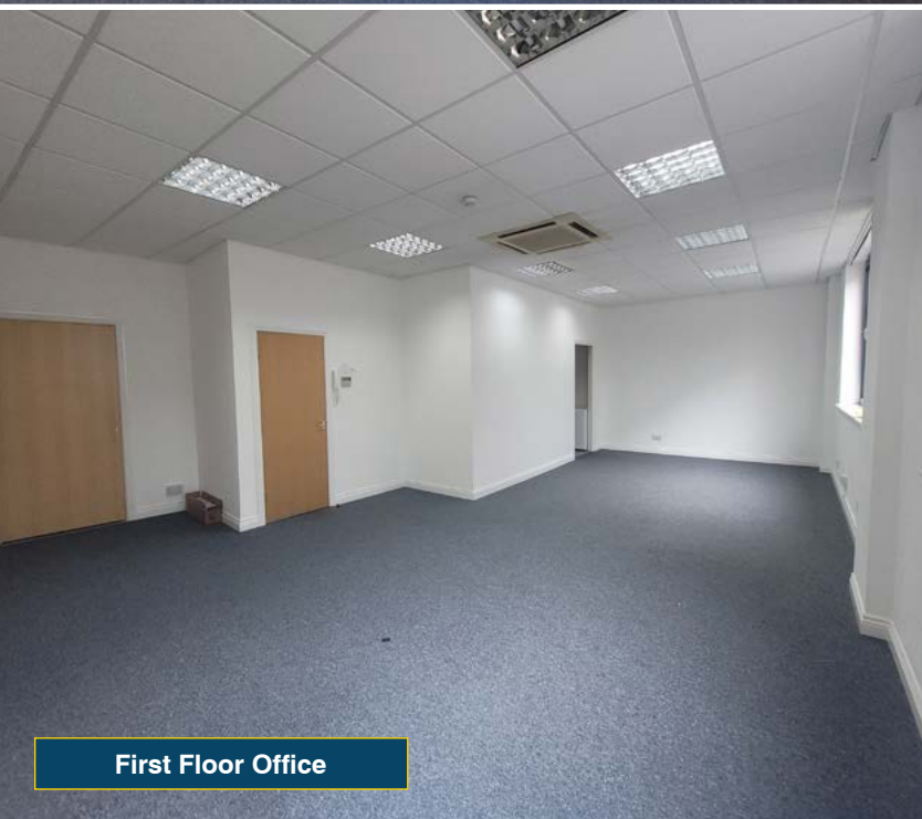
First Floor Office