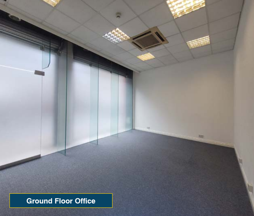
Ground Floor Office