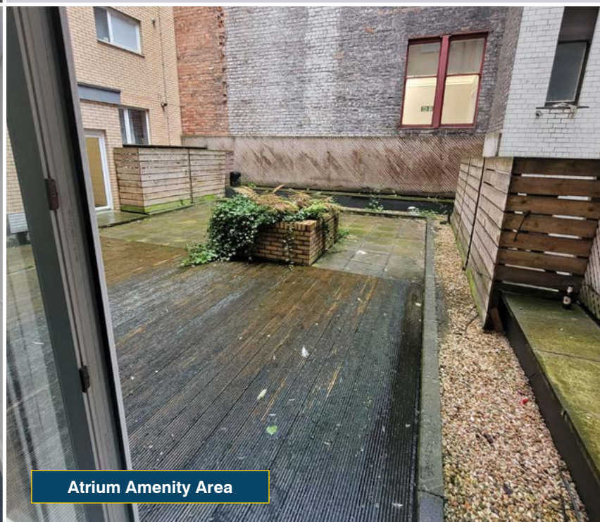
Atrium Amenity Area