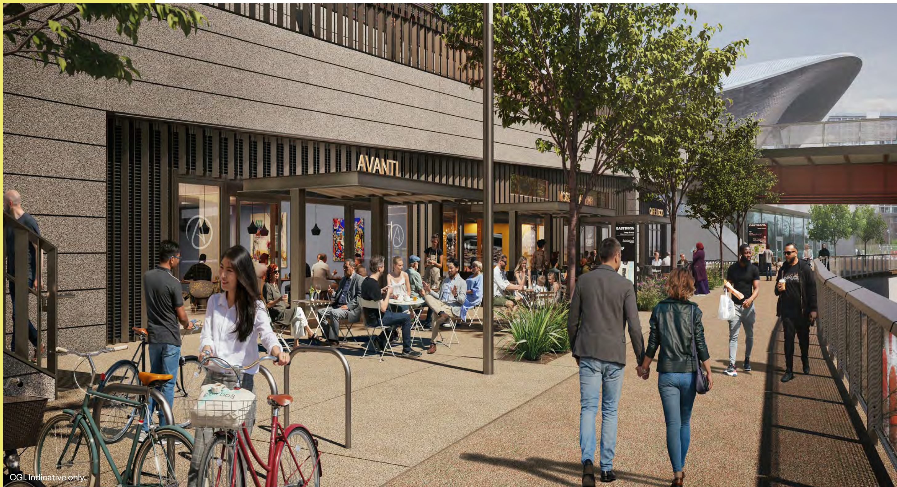
CGI. Indicative only.