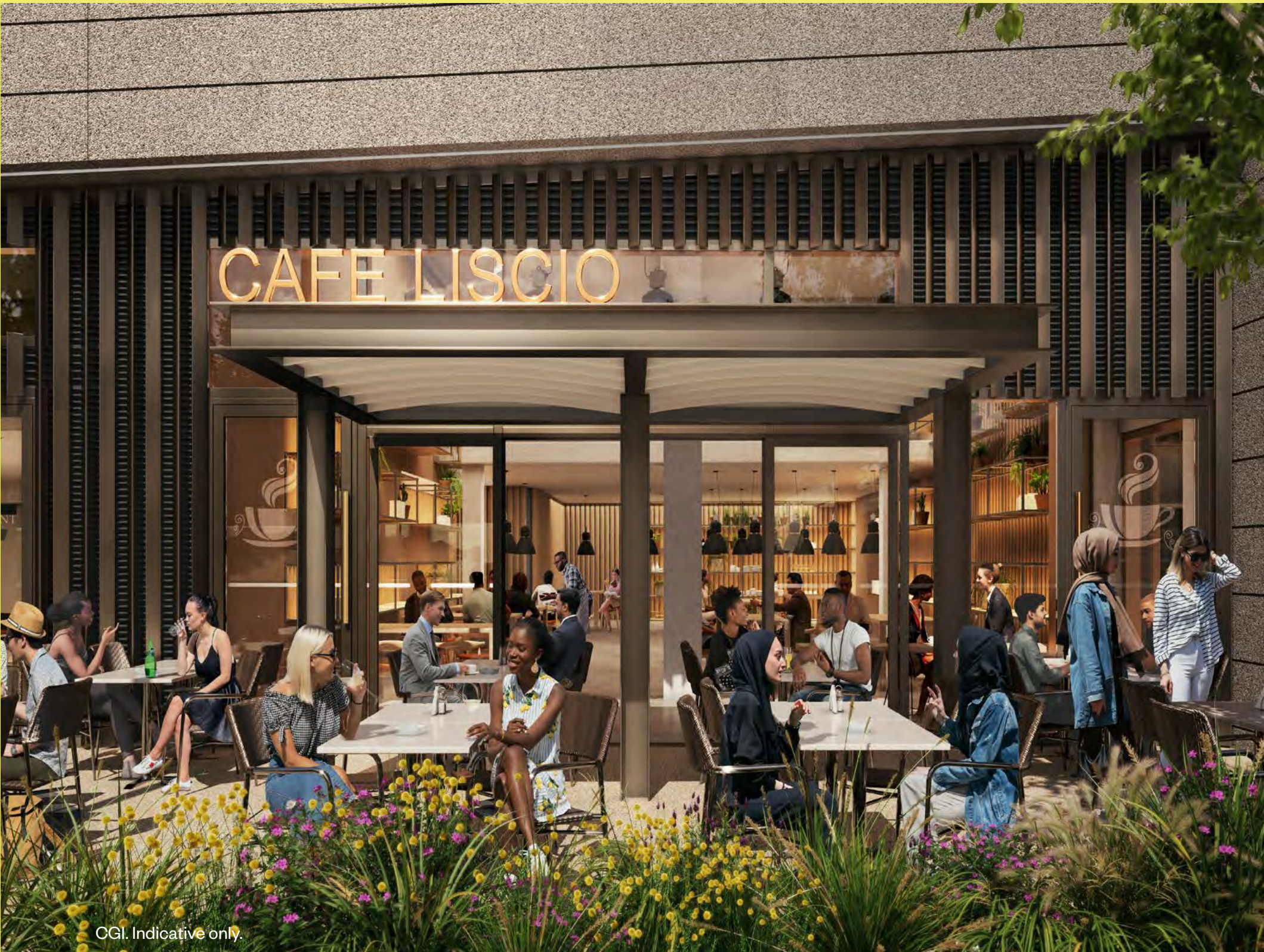
CGI. Indicative only.