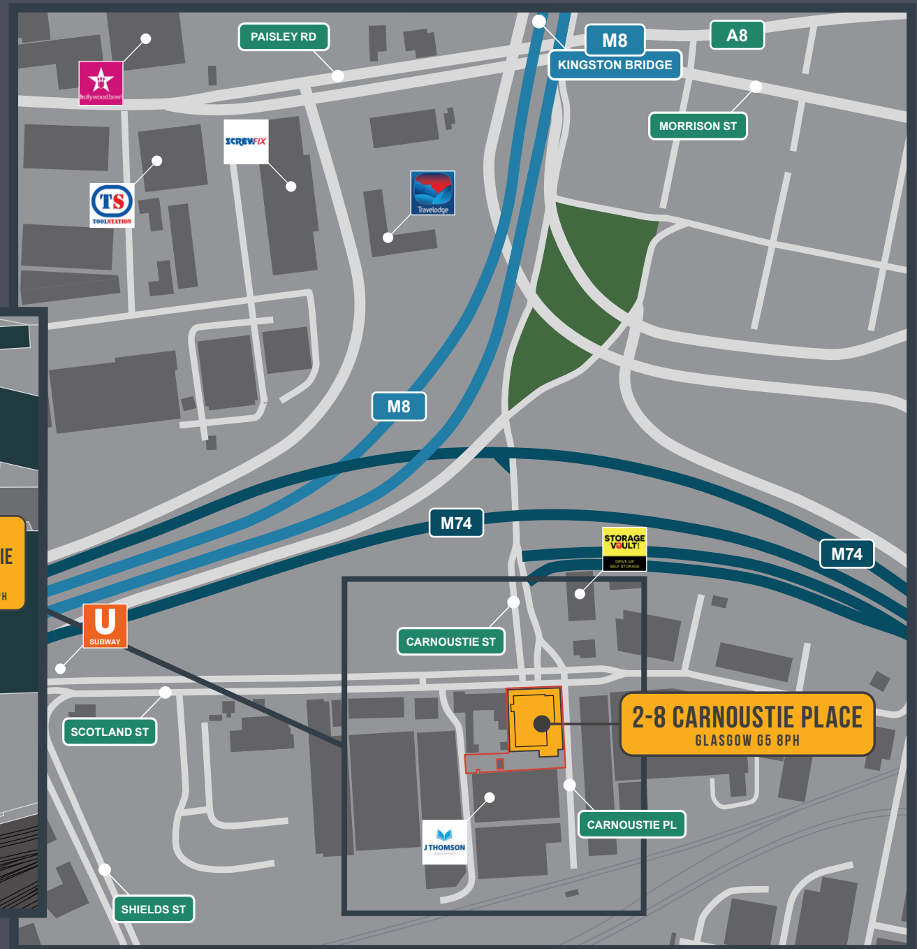
2-8 Carnoustie Place, Glasgow G5 8PH