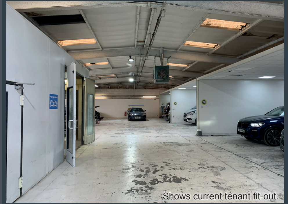
Shows current tenant fit-out.