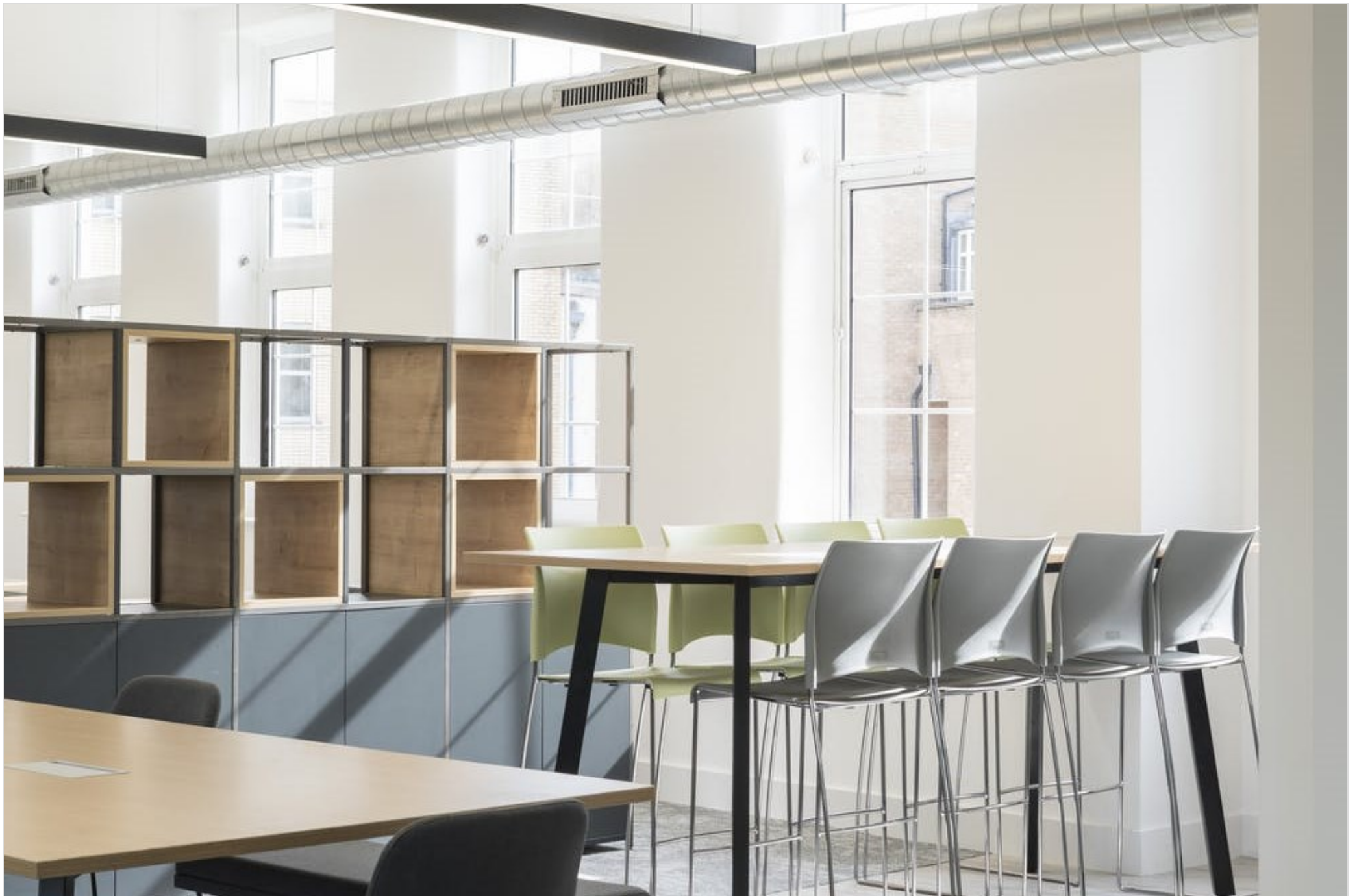
Prospero House, 241 Borough High Street, London, SE1 1GA