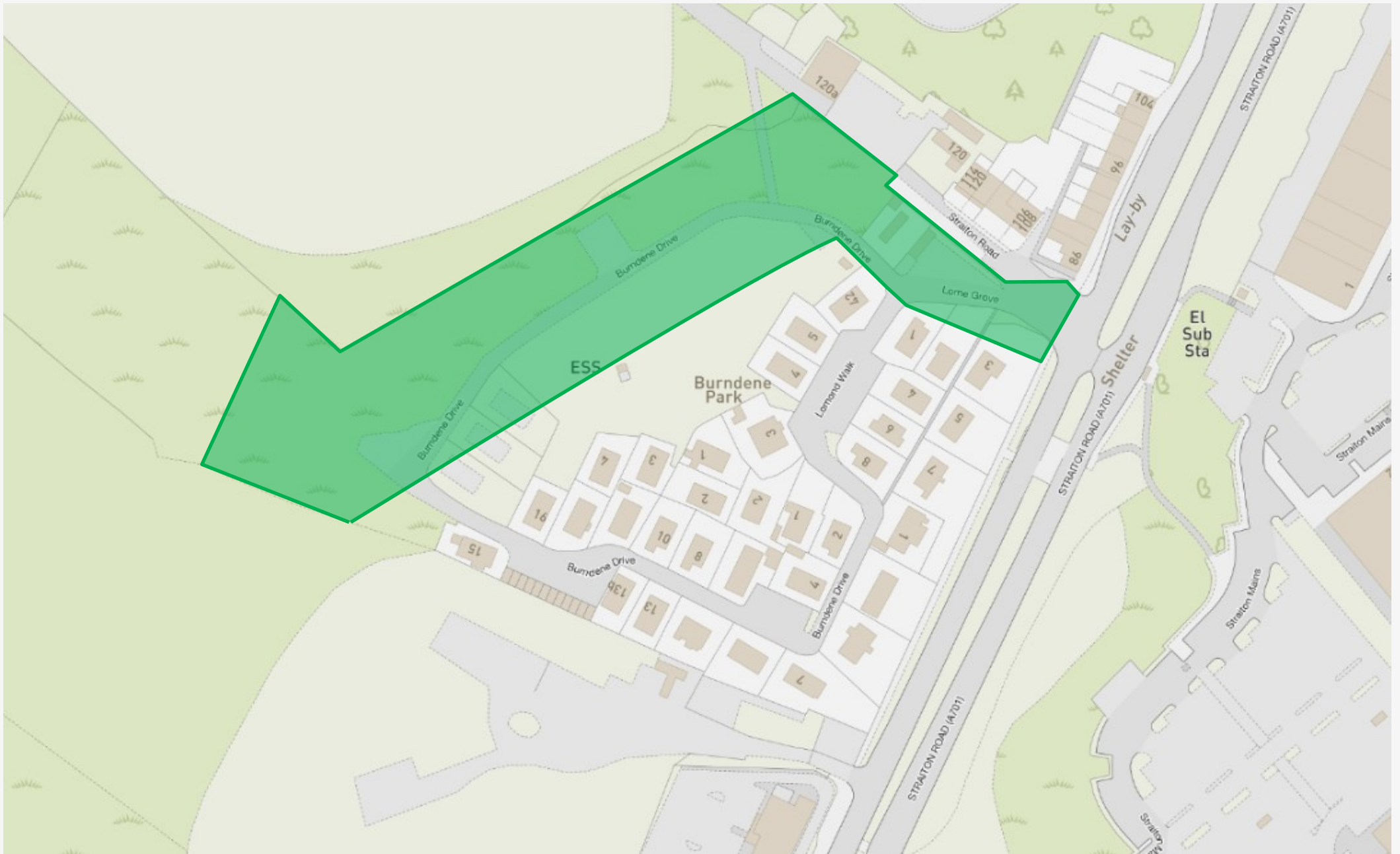
Boundaries shown for illustration only