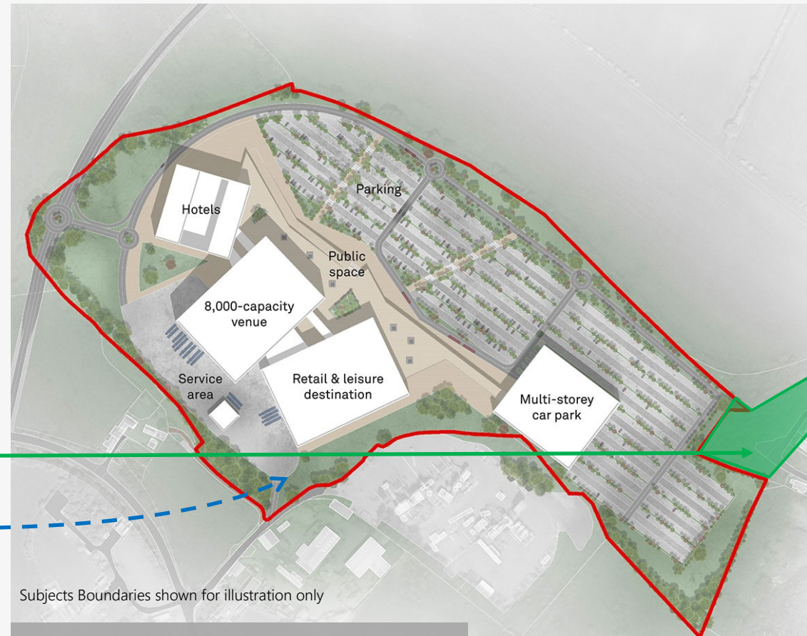
Subjects Boundaries shown for illustration only Extract from Lothianleisure.com promotional website