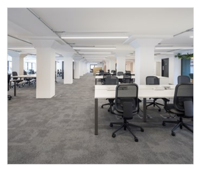
India House, 45 Curlew Street, London, SE1 2ND