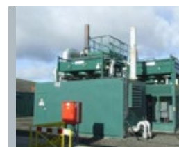
Dry Anaerobic Digester