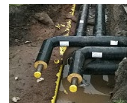
Landfill Gas Fuelled District Heating System