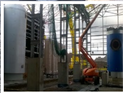
Thermal stores & heat exchanger