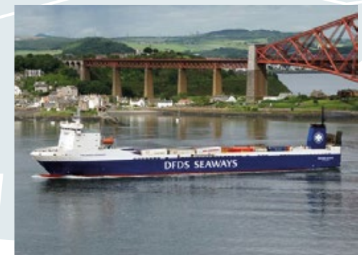
Rosyth-Zeebrugge Freight Ferry