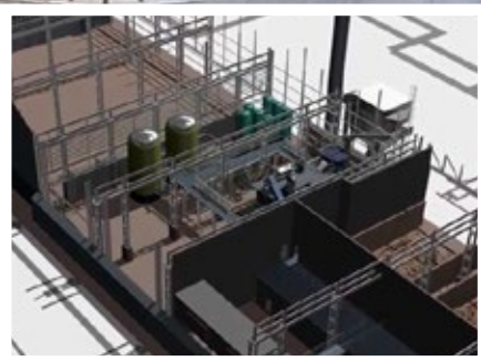
Energy Centre – 3D impression