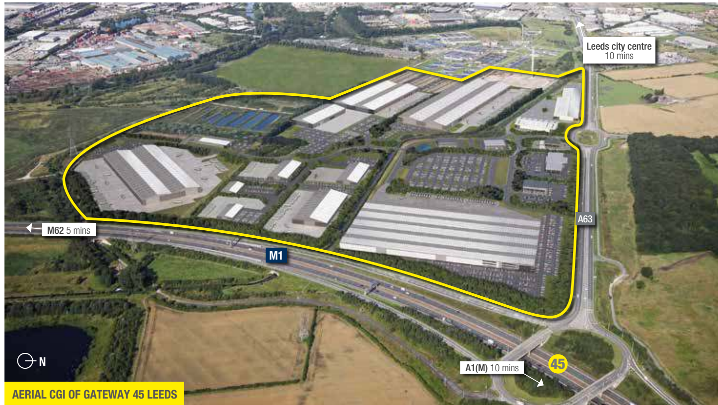
AERIAL CGI OF GATEWAY 45 LEEDS

The site also benefits from Central Government Enterprise Zone status, offering a range of incentives to occupiers.