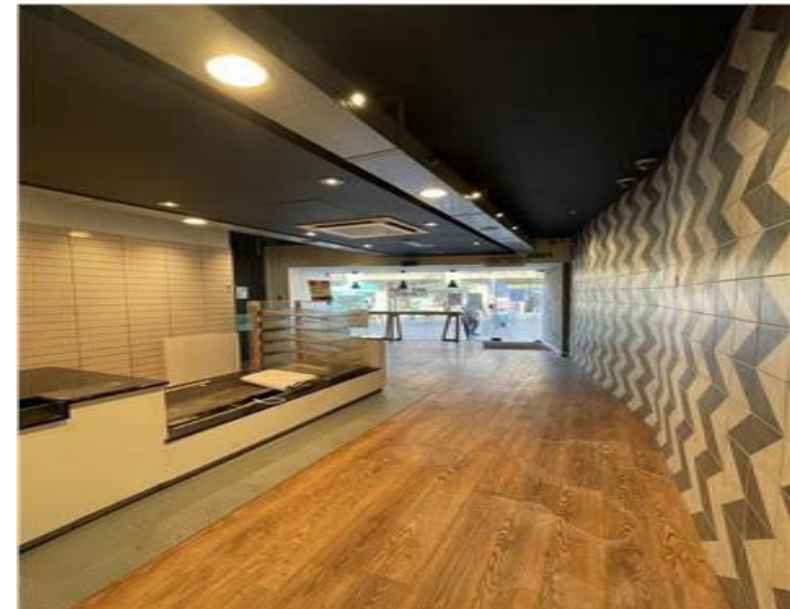
*Previous tenants fit out shown for illustrative purposes