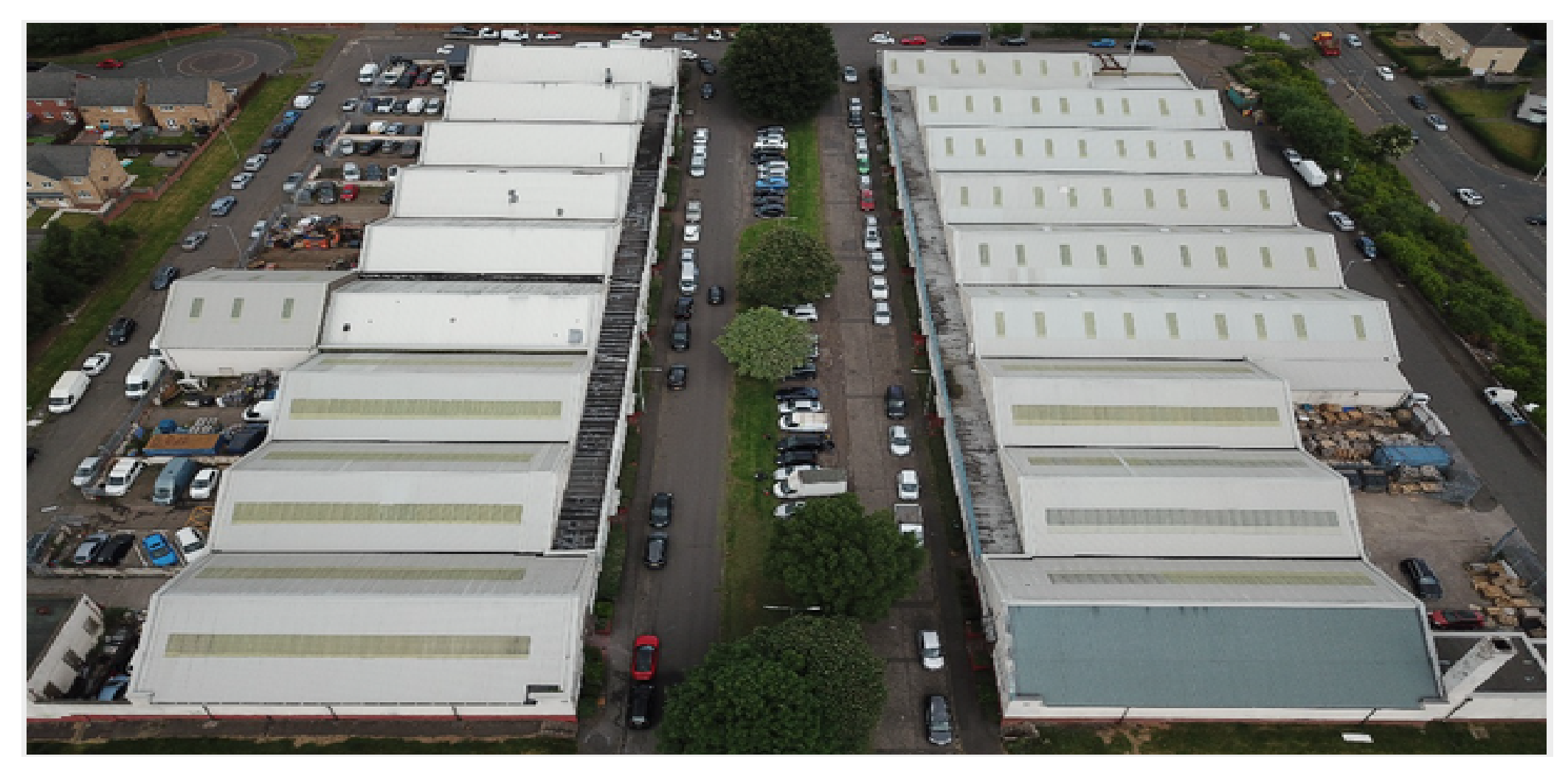
Unit 69 Carntyne Industrial Estate Camelon Street, Glasgow, G32 6AF